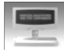
DSP-B03 Optional Short Pole Base