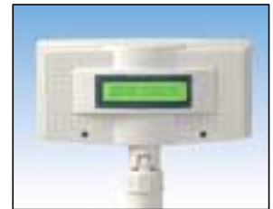
Optional Back LCD