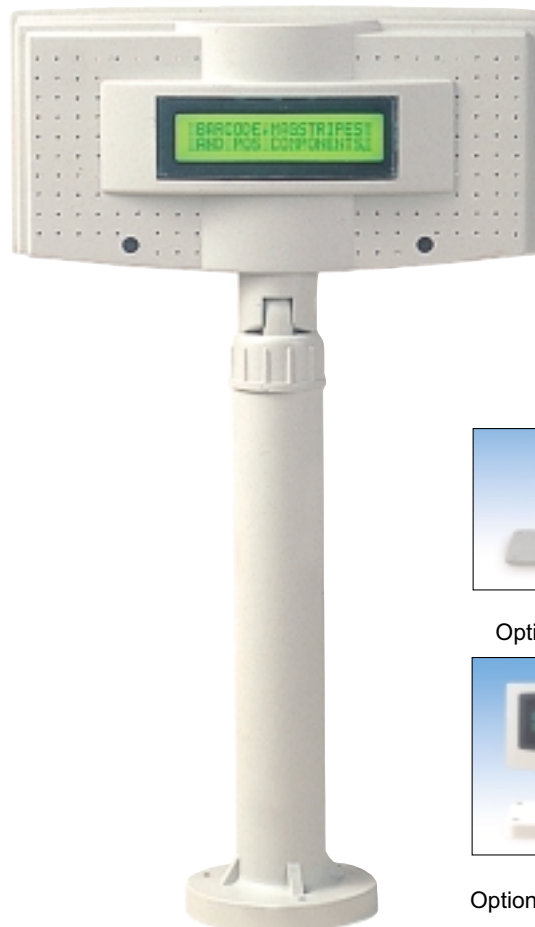
Optional Back LCD