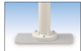
DSP-B02 Optional Metal Base