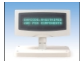
DSP-B03 Optional Short Pole Base

The VFD Series are powerful Vacuum Fluorescent Displays which provide a wide viewing angle, long life, high reliability and high display quality. They are designed to improve image and service with an enhanced customer display, featuring modular PC-based POS applications.